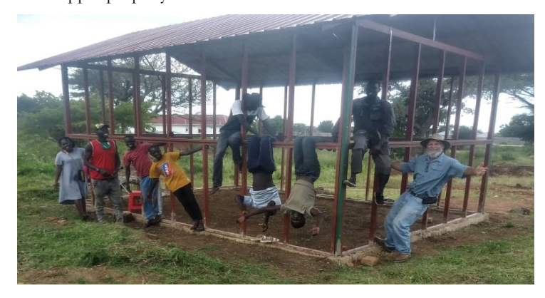
Waffle with his welding team, working on village church designs.

goats. As I ran, a sensation of dizziness and staggering became obvious to me. Rushing to the hut, brushing off the 100 bees clinging to the suit, I peel out of it and run for the Benadryl. I could feel the panic and the "fight or flight syndrome" coming on. I realized I was in serious